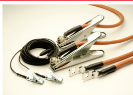
6220-755 5m Lead set (600 A)

2 x 50 mm 2 current leads with clamps and 2 x potential leads with clips.