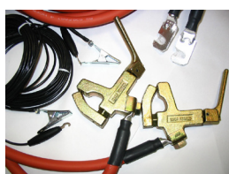
6220-756 10m Lead set

6220-755 supplied as standard with DLRO600-EN and DLRO600-FR